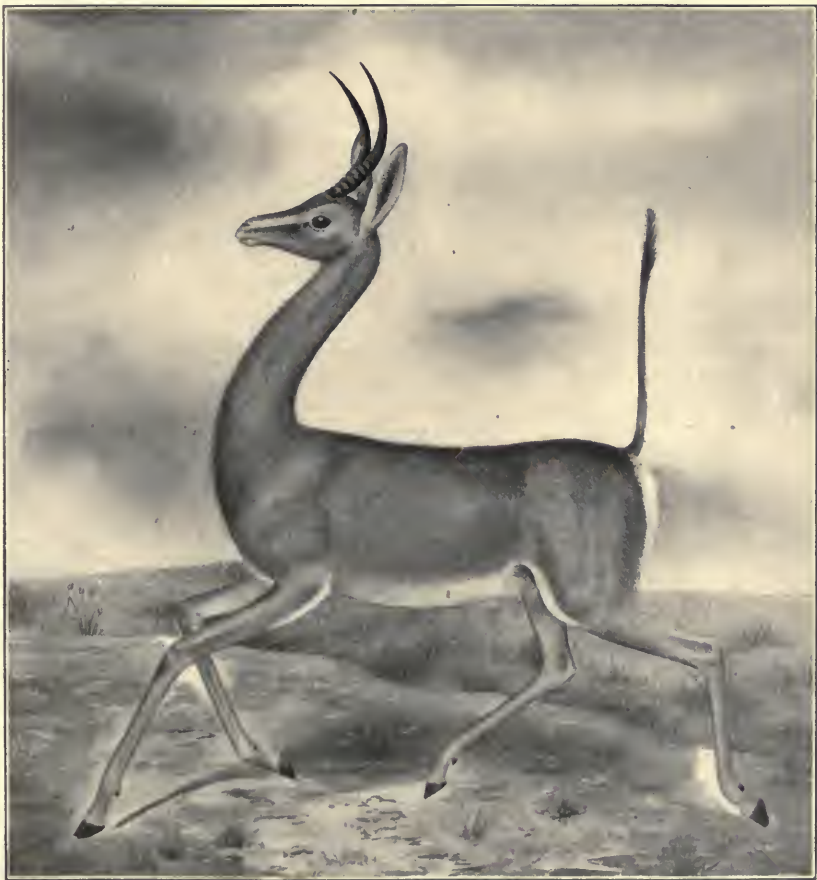
FIG. XVII. AMMODORCAS CLARKII. DIBATAG.

Ammodorcas clarkei Thos., Proc. Zoöl. Soc., 1891, p. 207, pls. XXI,